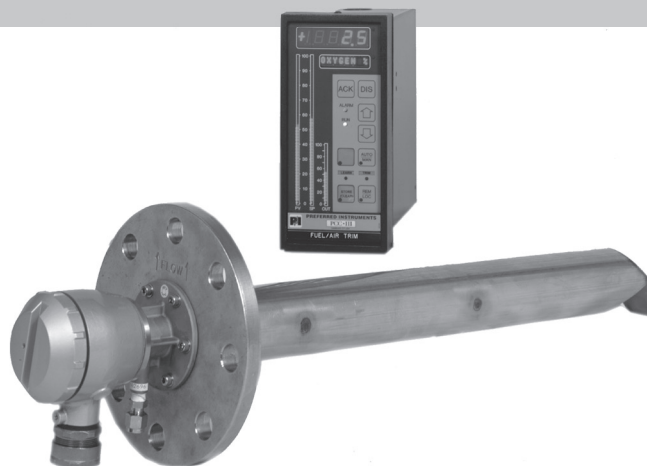
PCC-III Controller and Model ZP Oxygen Sensor

Preferred Instruments engineers and manufactures boiler control systems for commercial, industrial, and institutional facilities. Preferred's boiler control systems include combustion, feedwater (drum level), draft & flue gas recirculation control functions. Preferred's integrated control systems provide a full scope control package that assures safe and efficient control with undivided system integration responsibility.