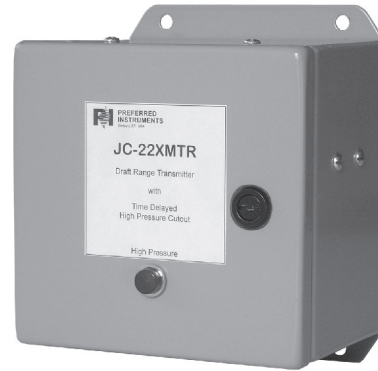
Draft Range Transmitter Assembly Model JC-22XMTR (with door shown closed)

Provide a -1"wc to +1"wc, 4-20 mAdc boiler draft range transmitter and an independent high pressure cut-out with 5 second time delay. Instruments shall be provided with a dust-tight, splash-proof enclosure. The high pressure setpoint shall be field adjustable from +0.15" wc to +4.0"wc. The high pressure switch shall be mounted and wired to a pilot light so as to illuminate when the switch activates and to a 5 second time delay relay so as to provide an isolated, 10 ampere contact for use in the Flame Safeguard Limit Circuit. The Draft Range Transmitter with time delayed high pressure cut-out shall be a Preferred Instruments, Danbury, CT Model JC-22XMTR.