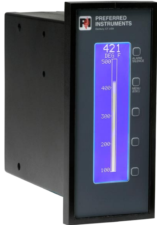
JC-15D Faceplate and Display

The Type J Thermocouple Assembly is constructed of a seal welded inconel sheath for corrosion protection, and can be directly installed in the boiler's flue gas outlet. The unit includes a ½" male NPT process connection, cast iron head with thermal block, and ½" female NPT electrical connection.